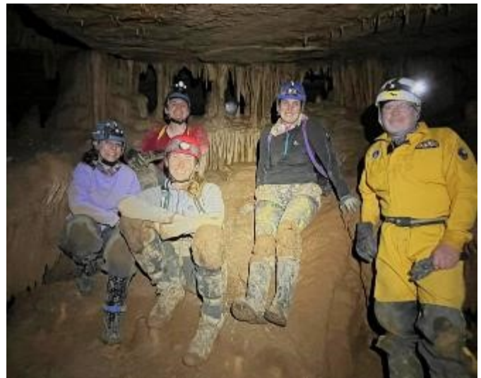
Above: the group relaxing after a day well spent.