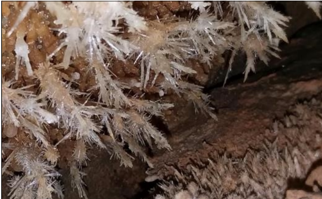
Gilley Cave crystals